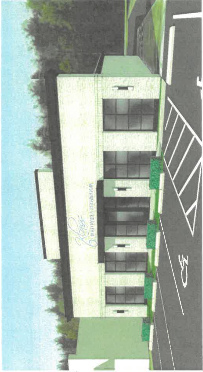
A :: VIEW SCALE: 1/8" = 1'-0"