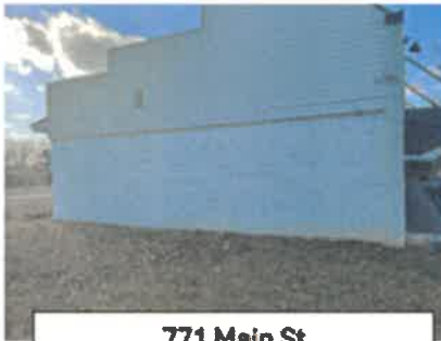
771 Main St

The PARB will work closely with Economic Development- Main St. Manager regarding site selection.