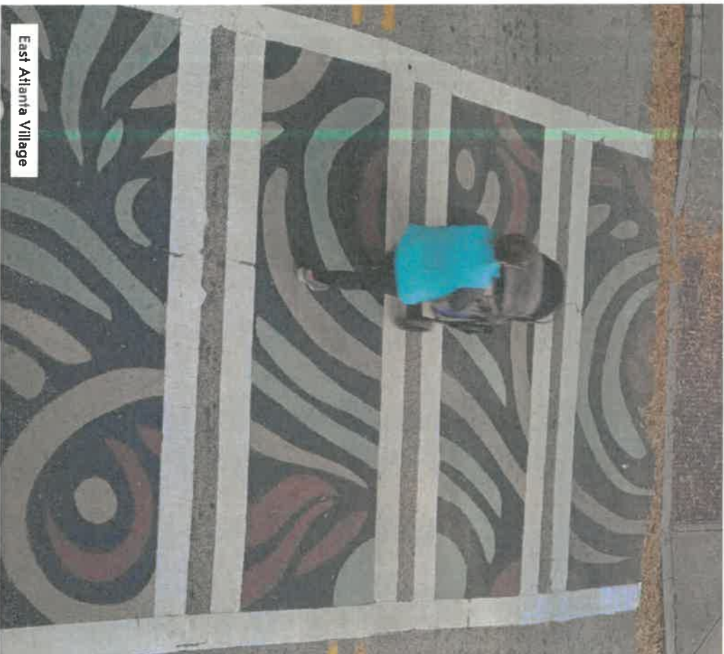
East Atlanta Village

Crosswalk art takes advantage of the city's most extensive public space, streets, to improve pedestrian safety, activate and beautify the public realm, and revitalize public spaces.