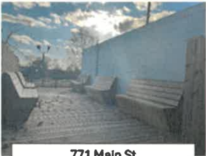
771 Main St