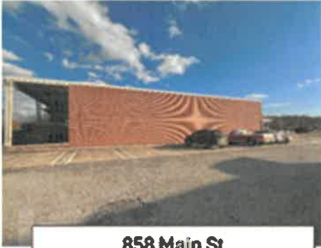
858 Main St

Some potential public art locations are: