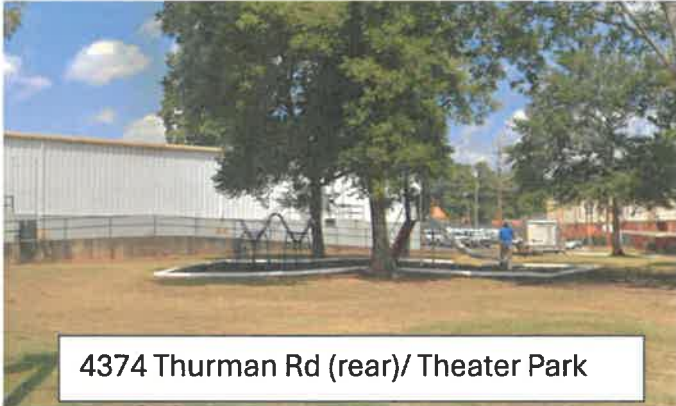
4374 Thurman Rd (rear)/ Theater Park