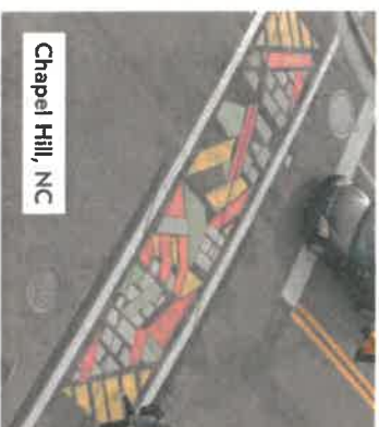
Chapel Hill, NC

Below are examples of pattern types for artistic crosswalks.