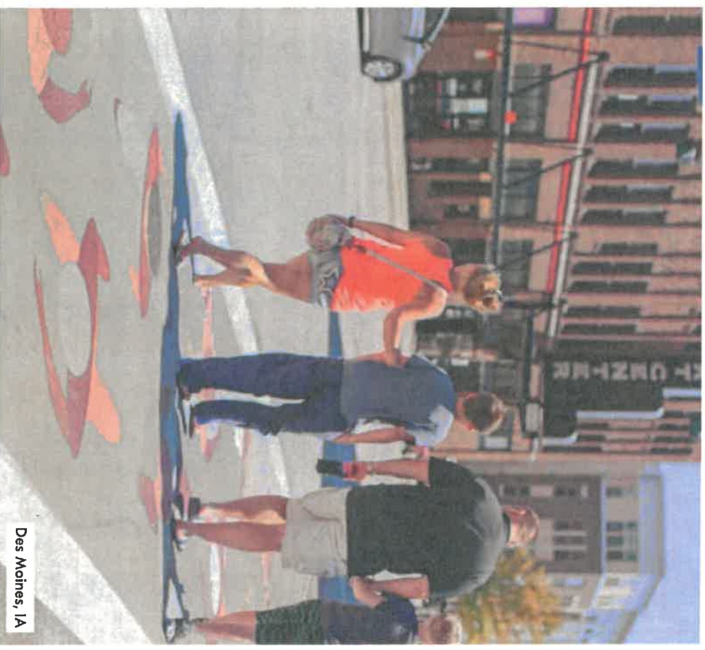
Des Moines, IA