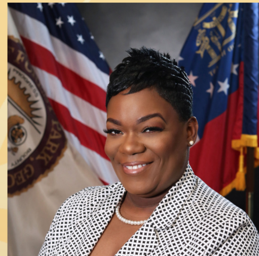
Councilwoman Latresa Akins-Wells, Ward 4