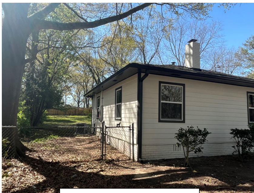
Side – West View