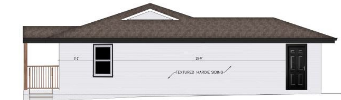
4 LEFT ELEVATION SCALE: 1/4" = 1'-0"