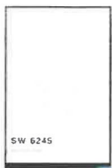
Exterior Paint: SW 6245 Quick Silver