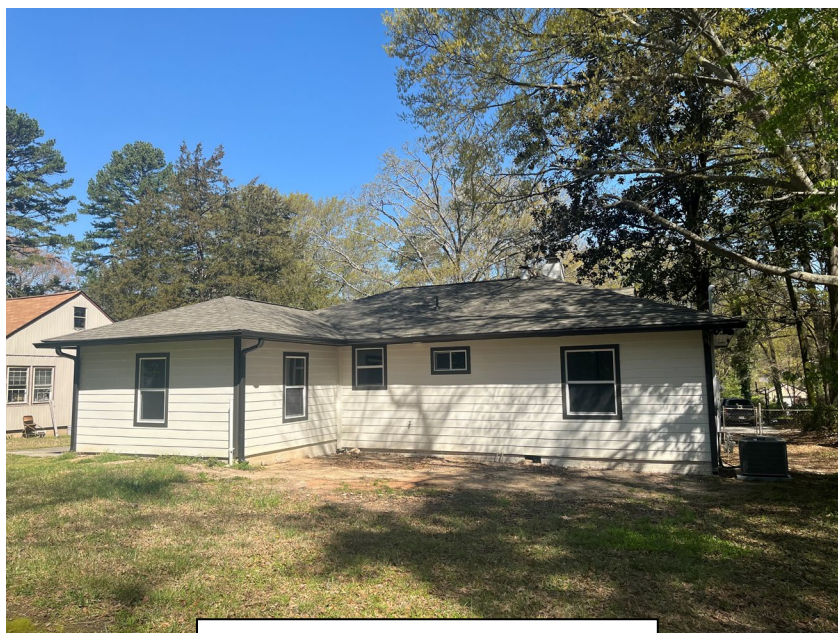
Rear – South View