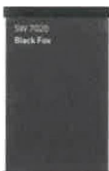
Trim & Gutters: SW 7020 Black Fox