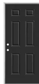
Side Door: 2'-8" 6-Panel Steel Exterior (Black)