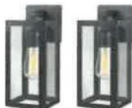
Porch Lighting: Visual Comfort Vado Large Wall Lantern (Black)