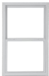
Windows: Single-Hung Vinyl (White)