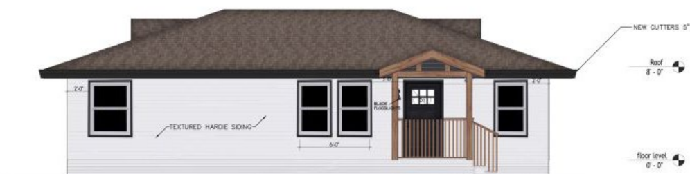
1 FRONT ELEVATION SCALE: 1/4" = 1'-0"