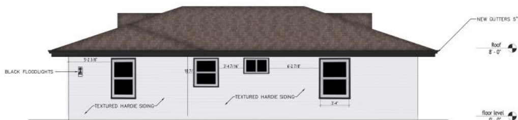
2 REAR ELEVATION SCALE: 1/4" = 1'-0"