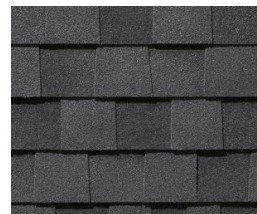
Roof: GAF Natural Shadow Weathered Wood Architectural Shingle