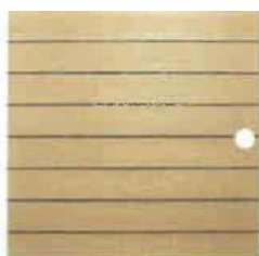
Siding: Hardie Plank (White)