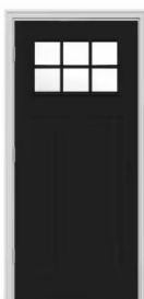
Front Door: 3'-0" Steel Exterior (Black)