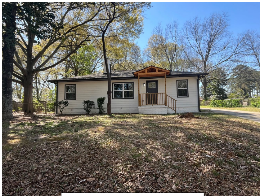
Front – North View