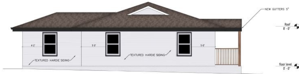
3 RIGHT ELEVATION SCALE: 1/4" = 1'-0"