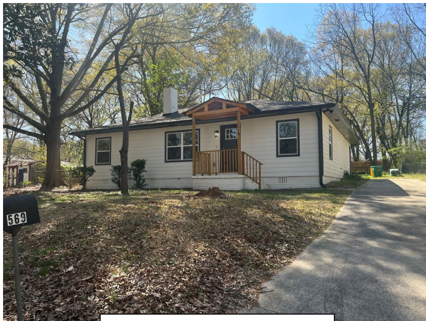
Side – East View