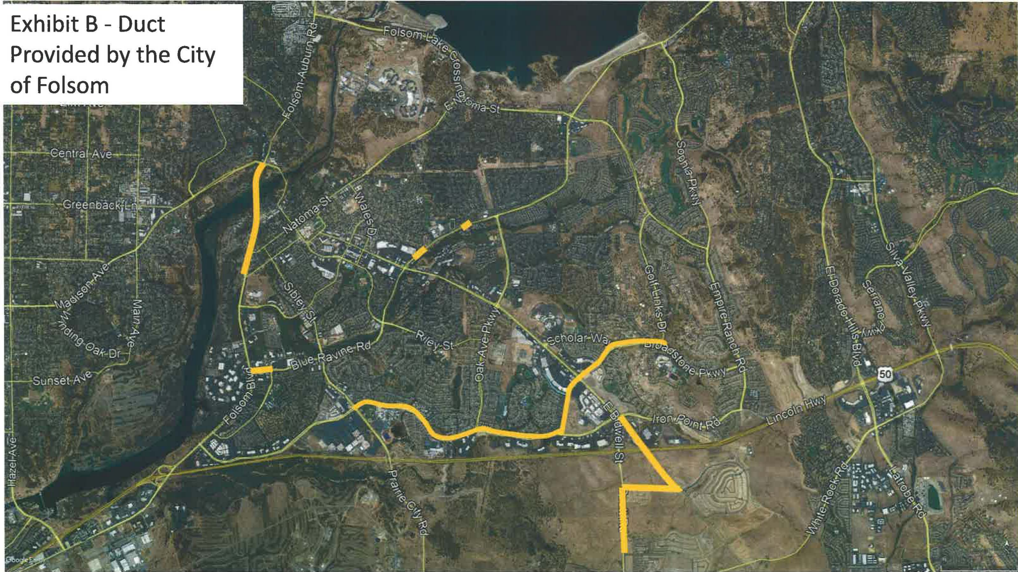
Exhibit B - Duct Provided by the City of Folsom