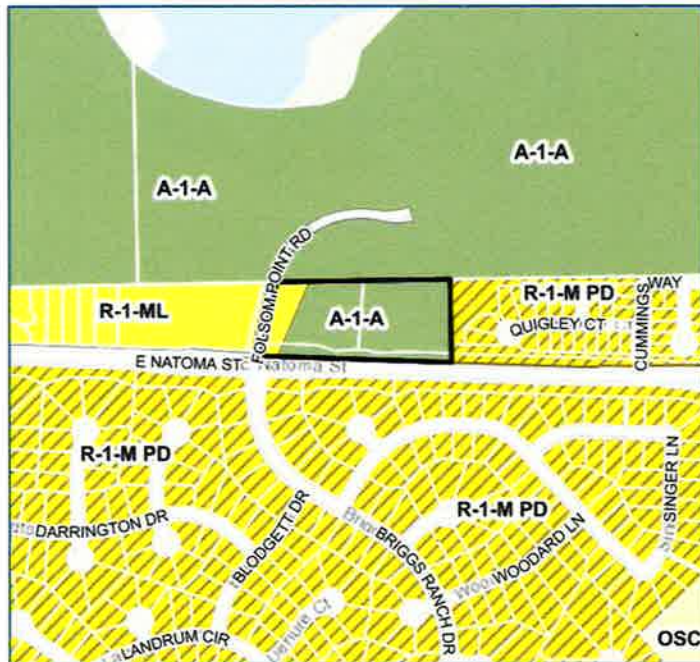
Existing Zoning Designation