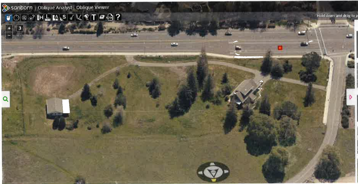
Site oblique imagery from 2018, facing south.