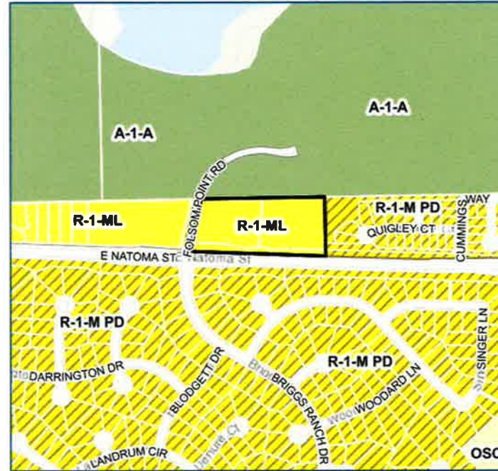
Proposed Zoning Designation