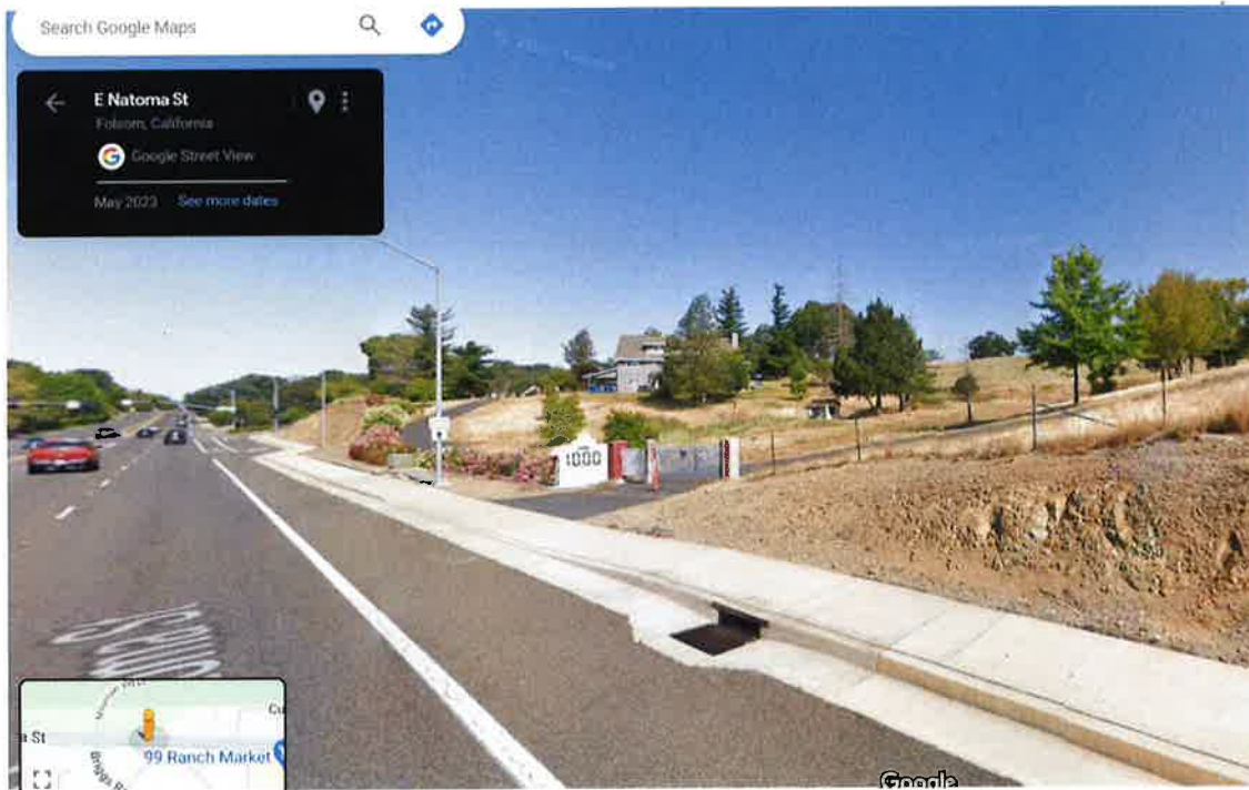
Site from E Natoma Street east of the Folsom Point Road intersection, facing northwest.