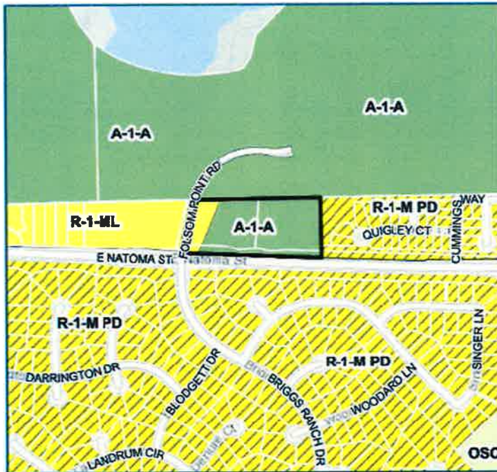
Existing Zoning Designation