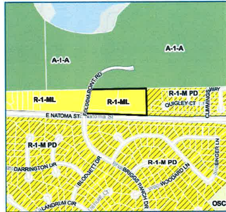
Proposed Zoning Designation