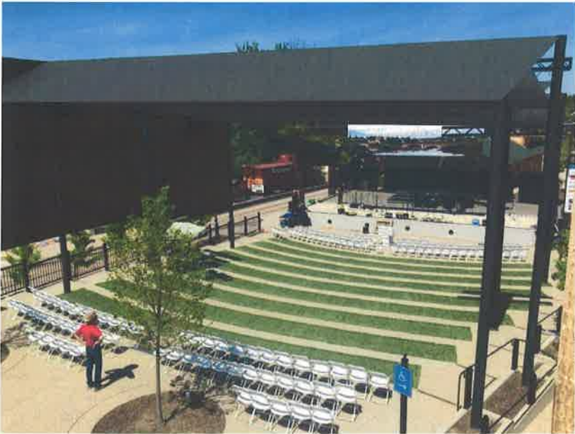
VIEW FROM ROUNDHOUSE PATIO