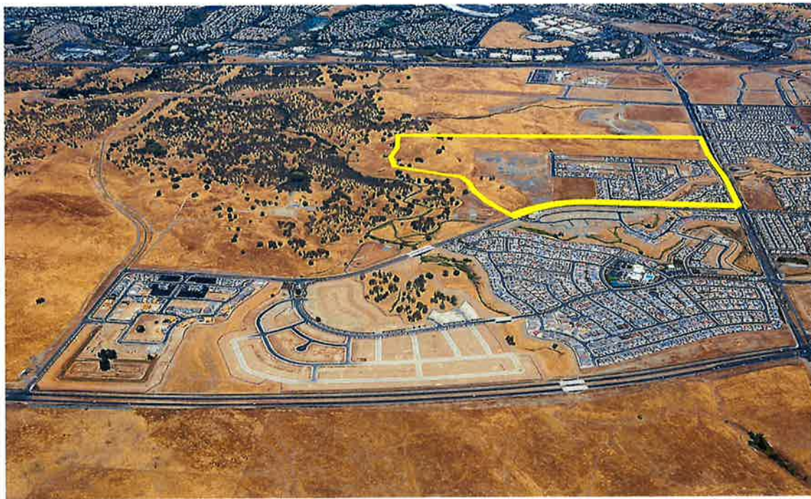
Photos taken September 11, 2024. The approximate boundaries of the Improvement Area have been outlined.