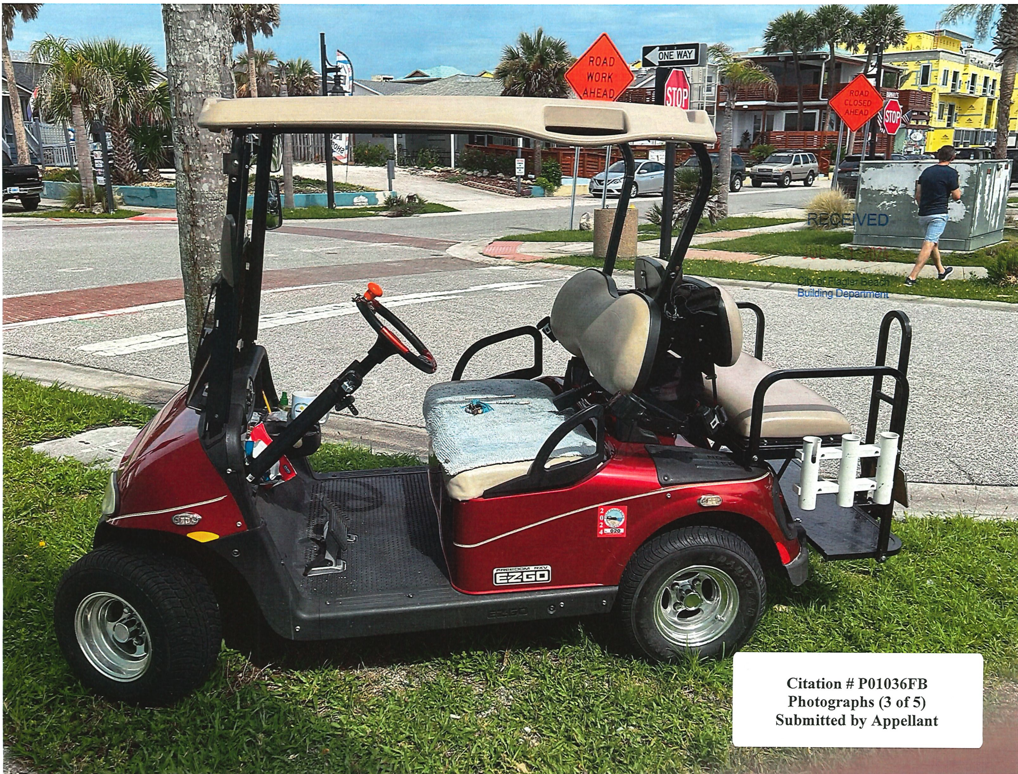
Citation # P01036FB Photographs (3 of 5) Submitted by Appellant