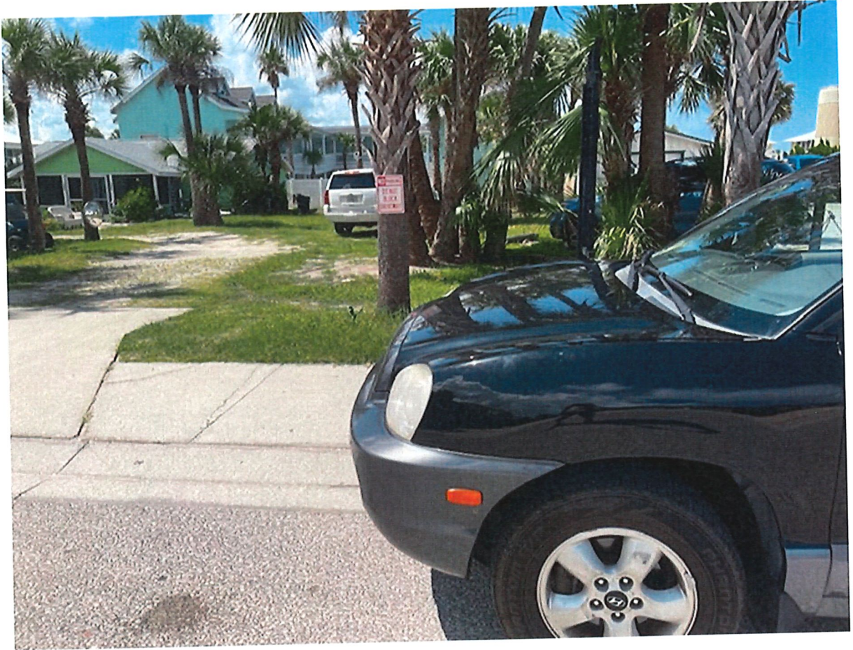
Citation # P01160FB