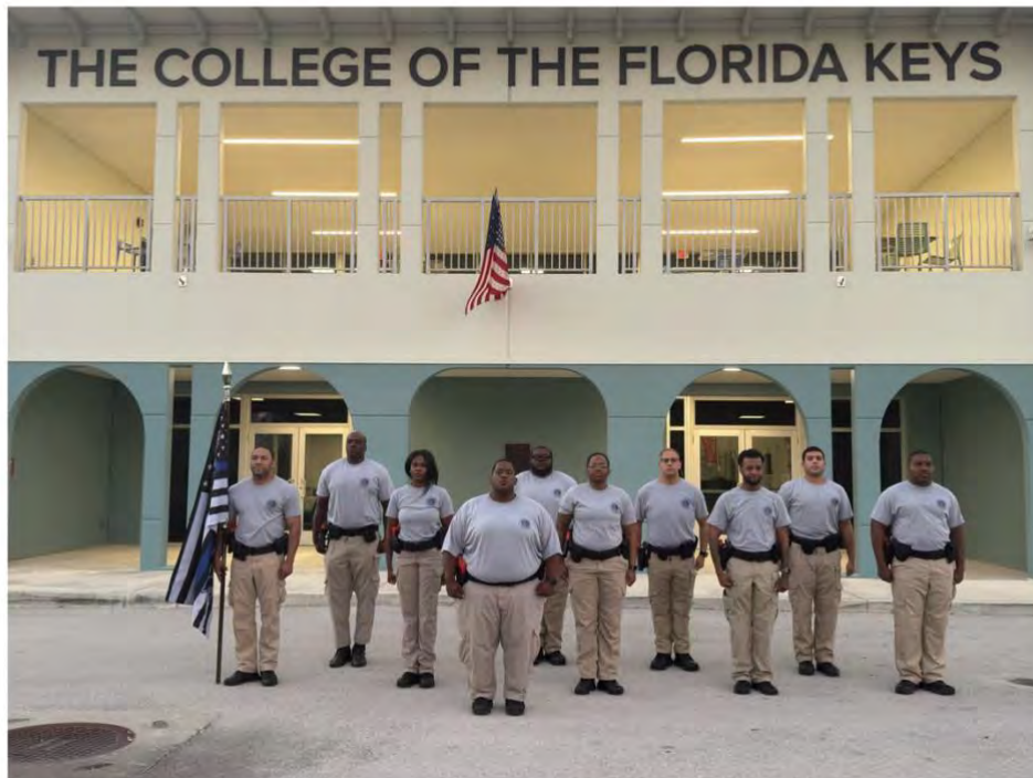
Crossover 37.

The College of the Florida Keys' (CFK) Institute for Public Safety (IPS) graduated the Crossover Corrections to Basic Law Enforcement (BLE) Academy #37 on October 17 at the CFK Upper Keys Center. Ten certified Corrections Officers successfully completed the 518-hour Crossover to BLE training program, and upon passing the State Officer Certification Exam, each will be eligible to become a Florida Law Enforcement Officer.