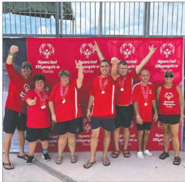
Members of the Key West State Swim Team.