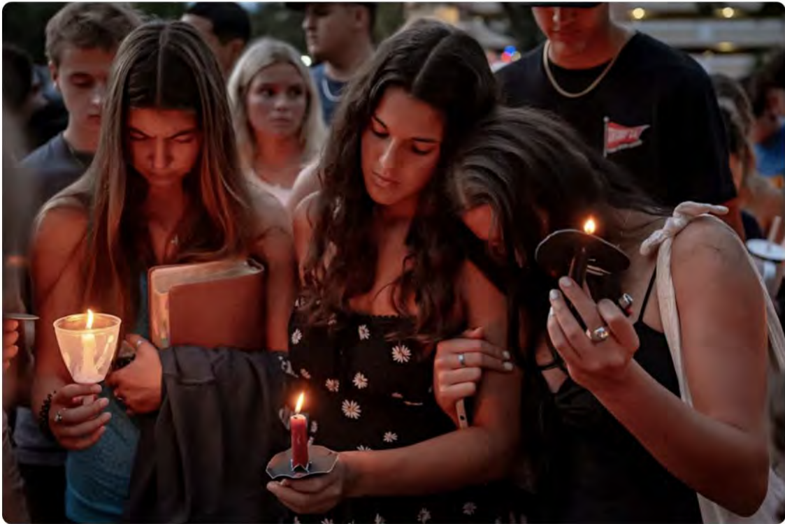
Florida Atlantic University students gathered for a Charlie Kirk candlelight vigil and prayers at the student union on the campus in Boca Raton, Fla., on September 11, 2025. Kirk, who founded Turnin... More