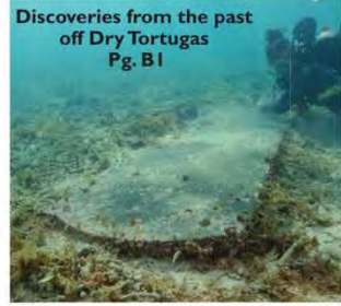
Discoveries from the past off Dry Tortugas Pg. B1