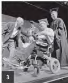
1. Graduates of CFK's spring class of 2023 pose in the front of the Key West campus.