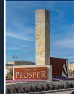
Location: Prosper, Texas Town of Prosper, Gateway Monument Design