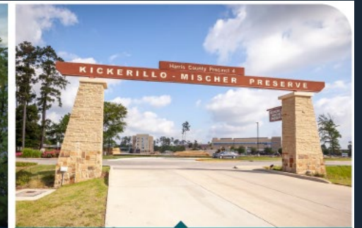
Location: Houston, Texas Harris County Precinct 4, Kickerillo Mischer Preserve Gateway