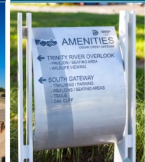
Location: Dallas, Texas City of Dallas, Cedar Crest Bridge and Gateway Improvements