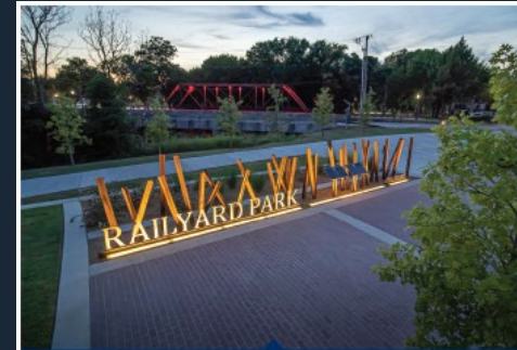
Location: Waxahachie, Texas City of Waxahachie, Railyard Park (Downtown Amphitheater)