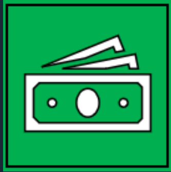
Financial Resilience and Responsibility