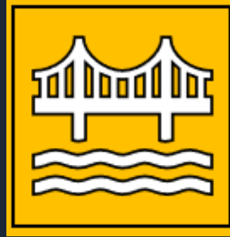
Reliable and Sustainable Infrastructure