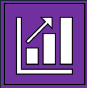
Responsible Growth Management