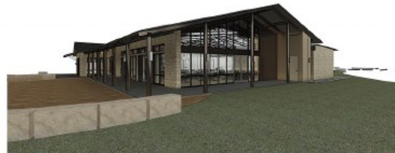
1 EAST TERRACE