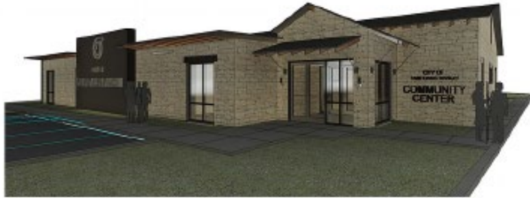
3 NORTH ENTRANCE VIEW