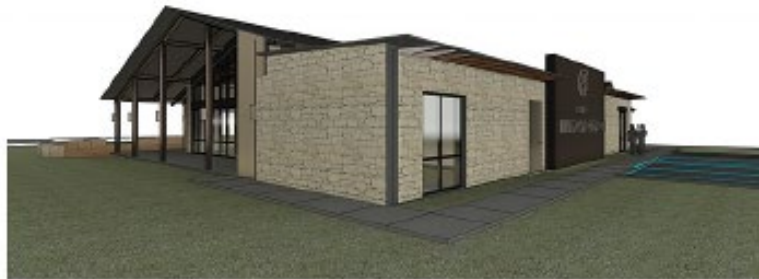
4 NORTHEAST VIEW