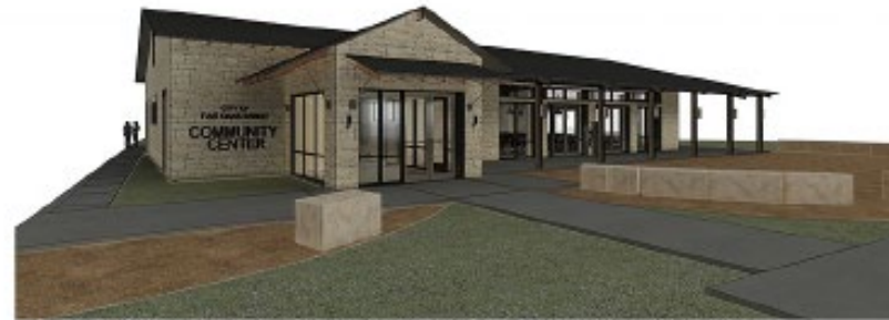
2 SOUTH ENTRANCE VIEW