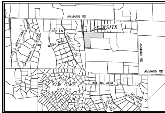
Exhibit A: Stone Creek Ranch Unit 2C Location Map