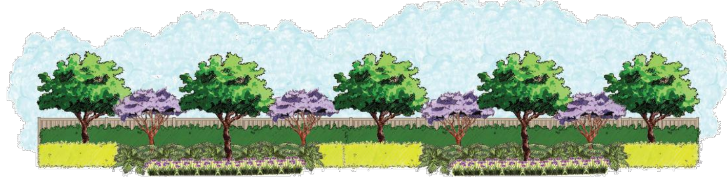
Typ. 15' Landscape Buffer - Waycross Ave. & SR44