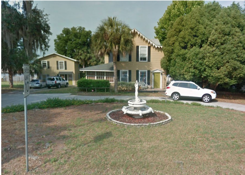
Google Street View January 2008