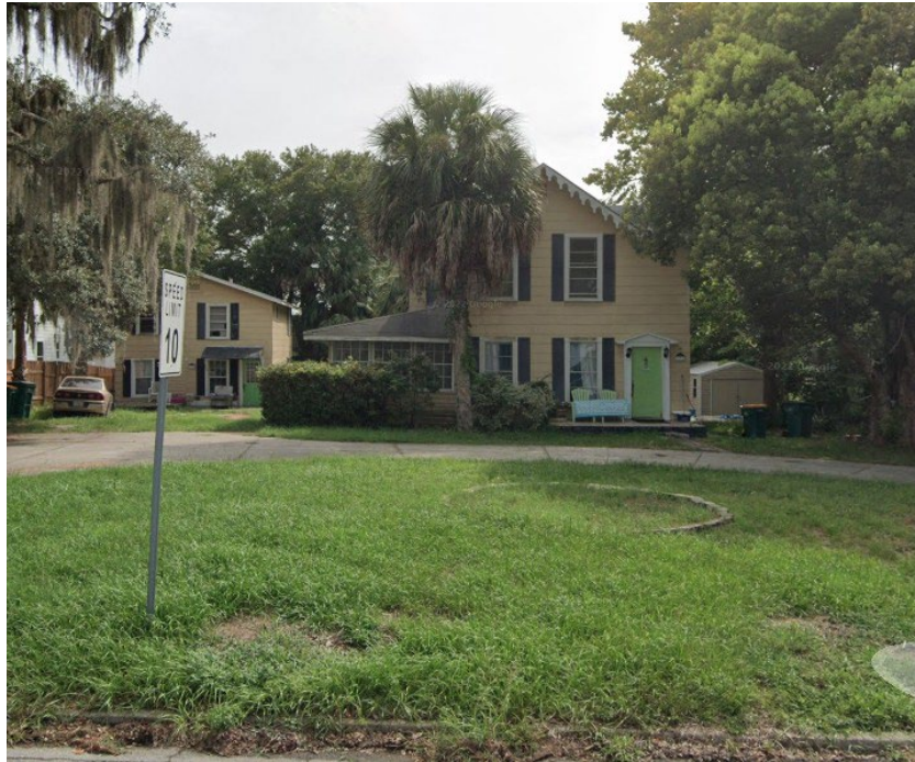
June 2017