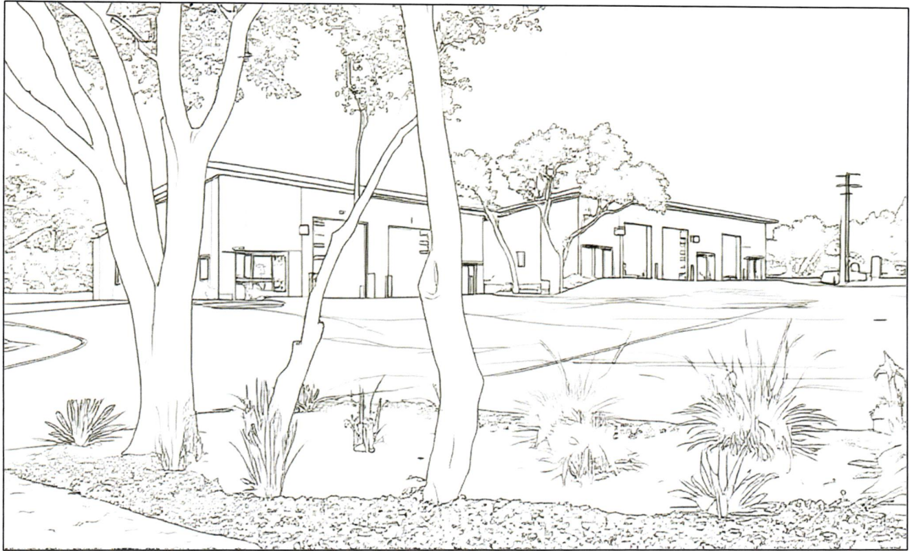
EXHIBIT C CONCEPTUAL BUILDING ELEVATIONS