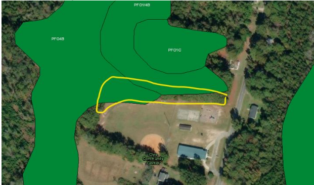
Photo 2 - Baker Site Wetland Delineation Area