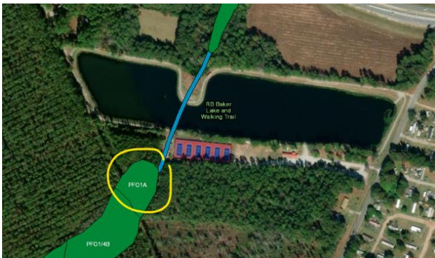
Photo 3 - ECRC Site Wetland Delineation Area