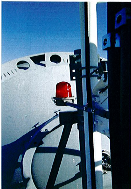
Picture 3: The FCC will allow an adjustment in the placement of an antenna with the proper filing, or the FAA (see AC70/7460-1K Chg 2) allows an adjustment in the placement of the lighting tiers by up to 10'. It is critical to understand that this is a 10' measurement from ground level, not to the base of the tower. Counting tower sections is not a safe means of measurement. All lighting must have an unobstructed view.

and cleaning of lenses on the lighting system at the tier levels. Crazed lenses (damage from UV rays and other sources creates tiny cracks in the lens that inhibit the output of the light) must be replaced.