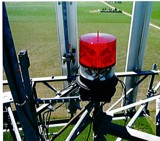
Picture 1: Beacon nested within panel antennas creating an unsafe, obstructed view. Not only is this tower owner subject to a Notice of Violation and forfeiture, the window of liability exposure is wide open if an aircraft incident occurs.

synchronized flash rate is between 27 and 33 flashes per minute (FPM) and the light output of the beacons remains within the allowable range of 2,000 candela +/- 25%. Considering the maintenance requirement for these lights, this is a very attractive option for many tower owners. A1 and E1 configurations filed under this stipulation must synchronize and flash the