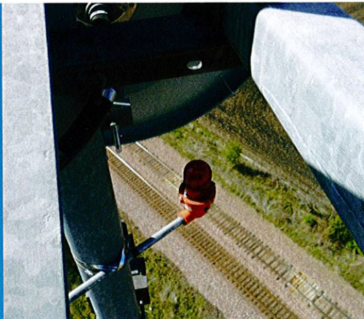
Picture 2: L-810 side marker light mounted behind antenna, creating an obstructed view.

supported by a top appurtenance. For example, the beacon can be mounted on a pole (the pole should be designed for this intent and certified to the TIA-222-G addendum II specification) and raised above an array of panel antennas. If raising the beacon would prohibit future inspection and maintenance, the beacon may be lowered to a maximum of 10' below the top of any antenna or