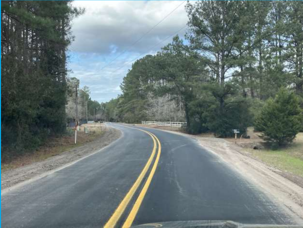
Beecher Road / Red Maple Road