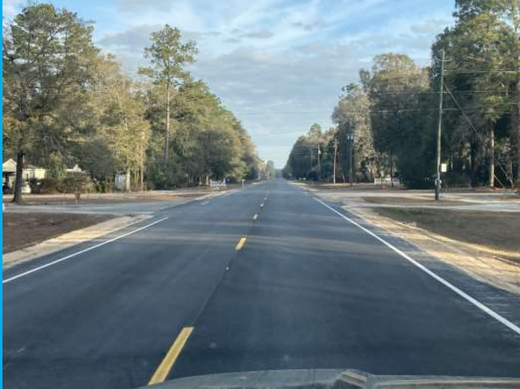
Sand Hill Road