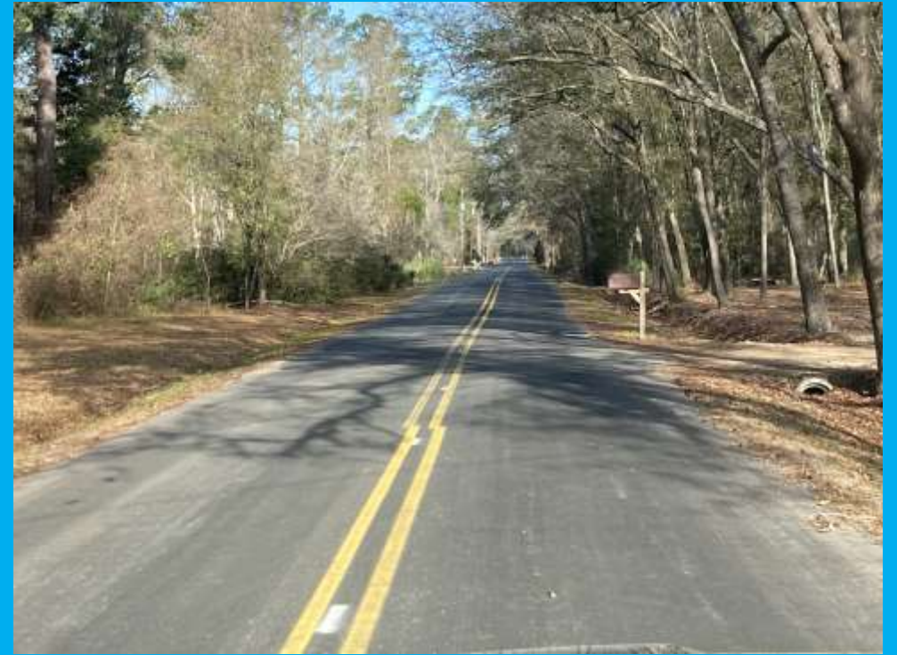
Exley Loop Road