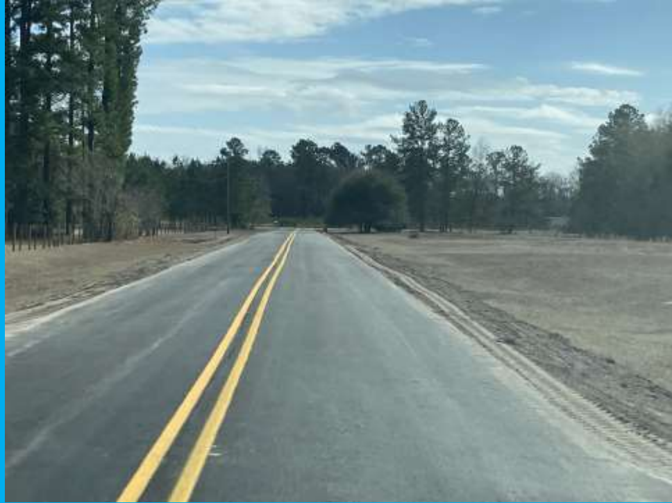
Reiser Road / Springhill Road