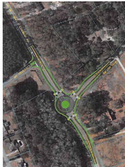
Figure 1-Roundabout-Preferred Alternative