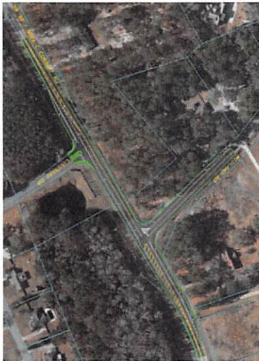
Figure 2-Left Turn Lanes-Secondary Alternative