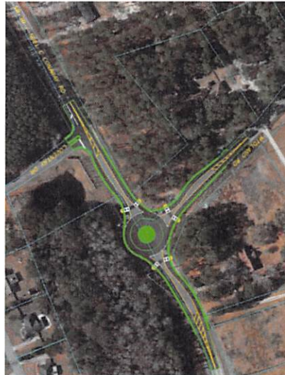
Figure 1-Roundabout-Preferred Alternative