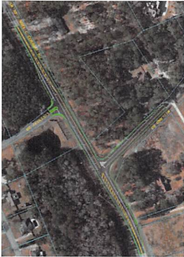
Figure 2-Left Turn Lanes-Secondary Alternative