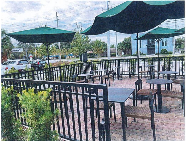
Sample visuals of outside patio internet usage

The outdoor patio for the building will have pavers and a seating area for anyone who wants to use internet outdoors. A wireless access point (WAP) will be installed along with power outlets for portable devices. Solar devices will be utilized where feasible. An outdoor 48" video screen will post jobs that are available from local employers. A 5 ft. high decorative iron fence will surround the site for access control and will include digital keypad locked entrance.