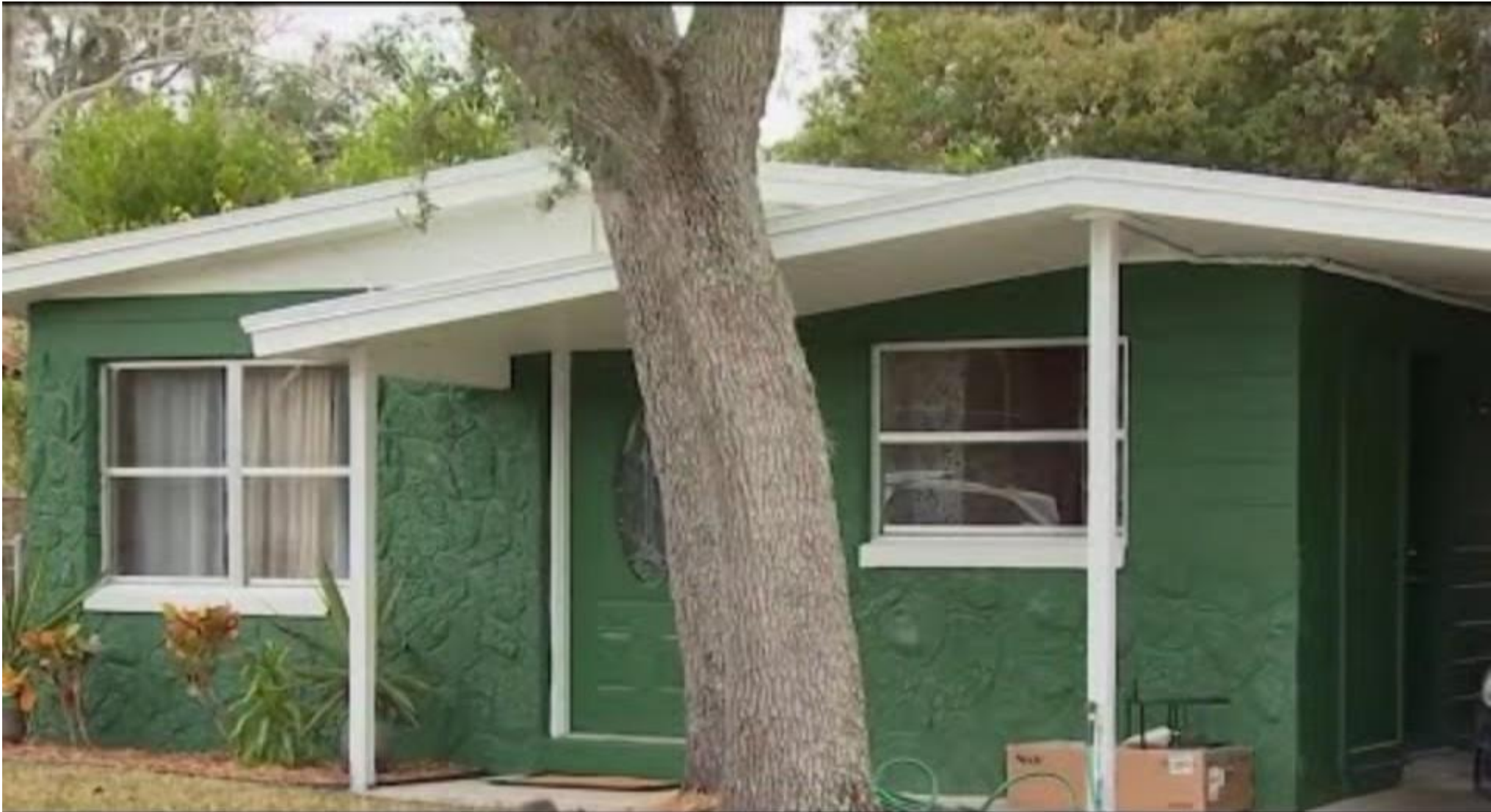
Helping Two Seniors in the Community