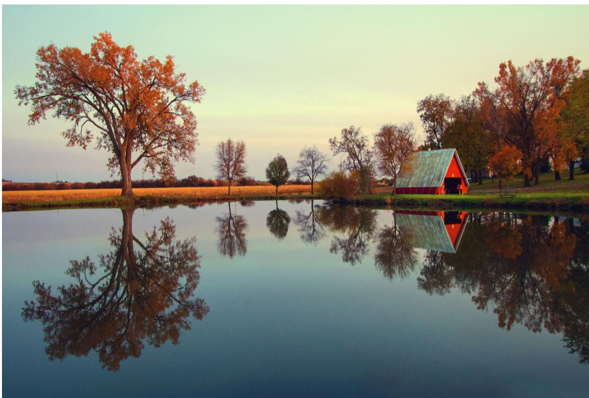
1st Place Iowa Landscape & 2nd Place Best of Show

15th Annual Keep Iowa Beautiful Photography Contest Submission