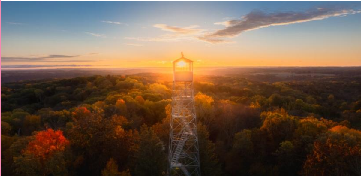
Photo Credit: "Iowa's Fire Tower", Cody Davis of Grinnell, 2nd Place Iowa Landscape

15th Annual Keep Iowa Beautiful Photography Contest Submission