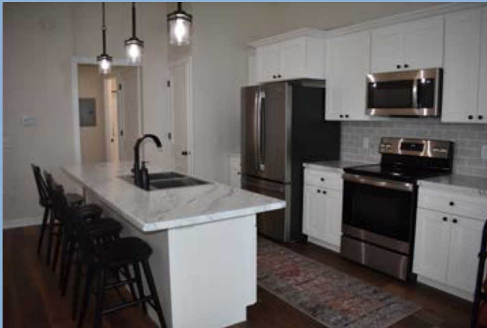
The Air BnB kitchen area

The Community Catalyst Building Remediation Program assists communities with the redevelopment or rehabilitation of buildings to stimulate economic growth or reinvestment in the community. Funding is based on annual availability, maximum grant is $100,000, and 40% of funds will be awarded to cities with populations under $1,500. Funds available for the rehabilitation of one commercial building per community or two buildings with same ownership that are adjacent. Deconstruction is allowed in dire situations or for safety reasons. City must be the applicant and provide financial and/or in-kind resources. Pre-applications are due January 31, 2024 and if invited to apply, full applications are due April 14, 2024. Please visit https://www.iowaeda.com/downtown-resource-center/community-catalyst/ for more information or contact Marla Quinn, Grants and Municipal Coordinator, at mquinn@ecia.org .