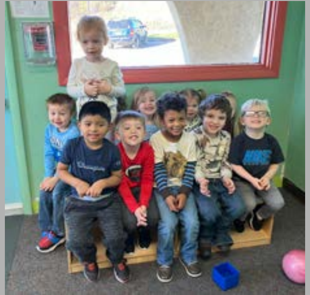
The kiddos are super excited for the project!