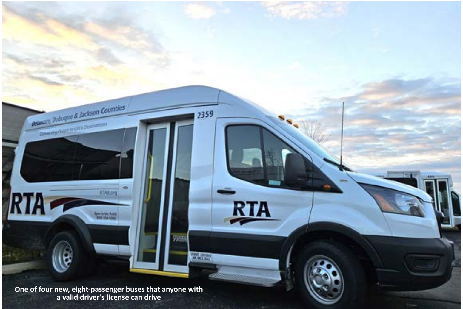
One of four new, eight-passenger buses that anyone with a valid driver's license can drive