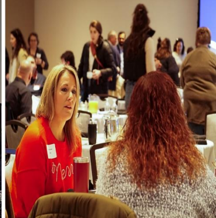
Scenes from our recent Workforce Solutions Breakfast, held in the new Reflections Event Space at the O Casino + Resort.