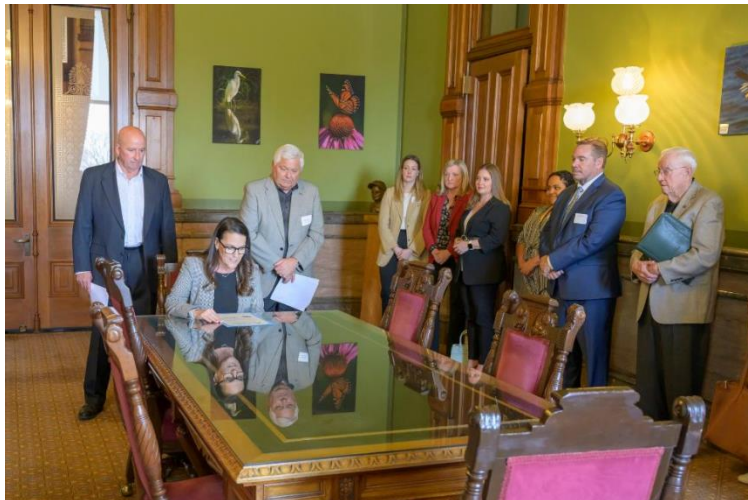
Lieutenant Governor Chris Cournoyer reads a proclamation signed by Governor Kim Reynolds last spring declaring April 2025 as Keep Iowa Beautiful month.

Visit our website to customize an editable proclamation to take to your civic and community leaders to sign the commitment into action!