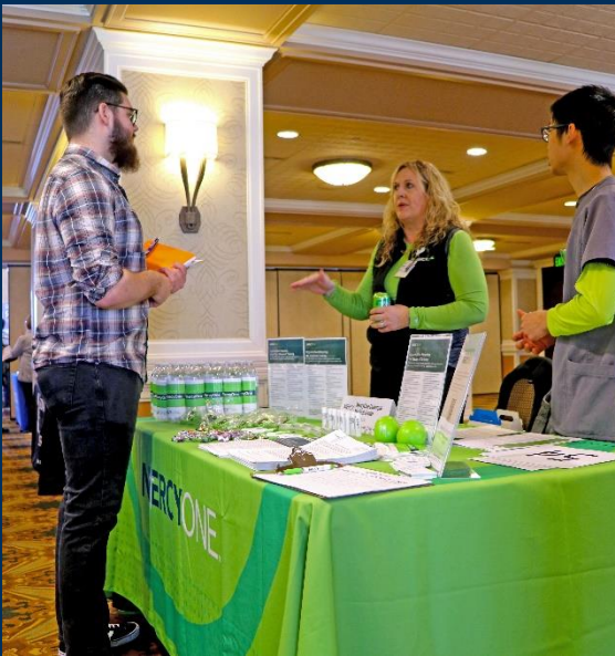
Job seekers and area employers connect at the AccessDubuqueJobs.com College Career & Professional Development Fair in March 2023.