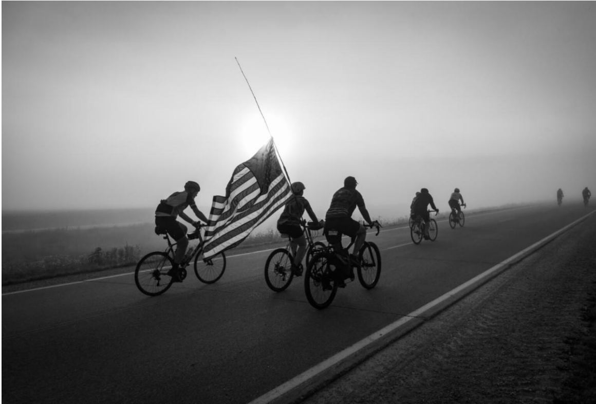
Iowans in Action 3rd Place 13th Annual Keep Iowa Beautiful Annual Photography Contest Submission