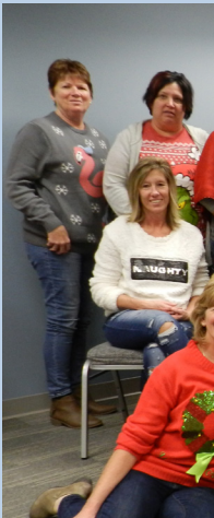
Staff celebrate Hall of Fame teambuilding event

After two regionwide meetings of the general membership of ECIA, the composition of the new ECIA Regional Planning Affiliation (RPA) Policy Board was agreed upon in late October. Membership will consist of representatives of the counties of Clinton, Delaware, Dubuque, and Jackson, the cities of Clinton, Maquoketa, and Manchester, and one small city in each of the four counties. The function of the RPA is to work jointly with the Iowa DOT in the formation of short and long range transportation plans which will be used to program the new ISTEAF funding. ECIA will be staffing the new organization, and the first meeting of the Policy Board will be held on January 26 . Currently the articles of agreement are being approved to determine which Policy Board members will be voting members.