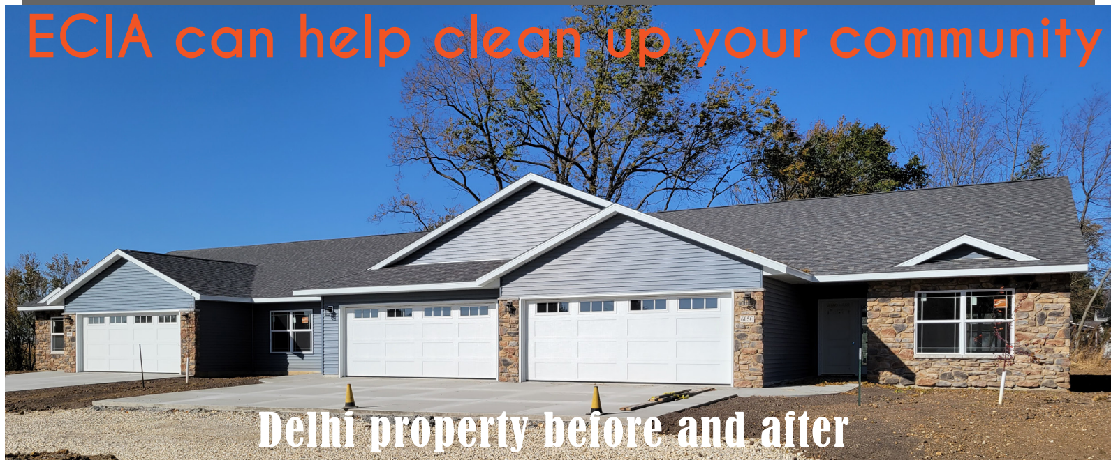
Delhi property before and after

A nuisance property creates serious problems for the community and headaches for the city officials who must deal with it. If left to deteriorate, these blighted properties become a chronic drain on time and resources for cities and counties. In 2019, ECIA launched a nuisance abatement program to assist cities and counties with their nuisance property enforcement and has had great success at an affordable cost.