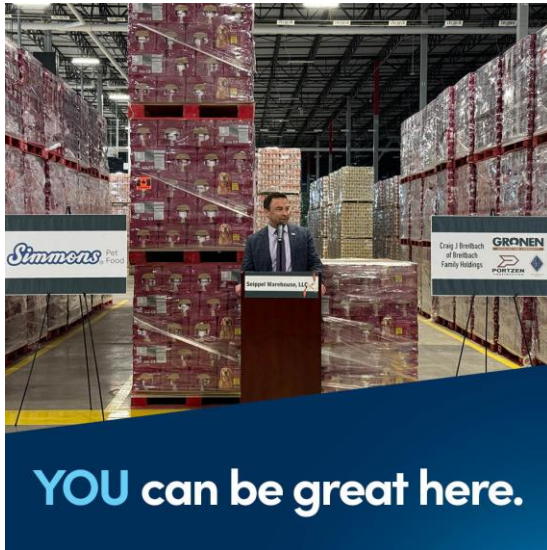
City of Dubuque Mayor Brad Cavanagh speaks at the ribbon cutting event for Simmons Pet Food's new Dubuque warehouse and distribution center.