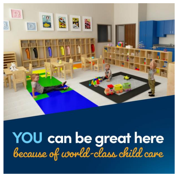
Rendering of proposed classroom at new child care center.