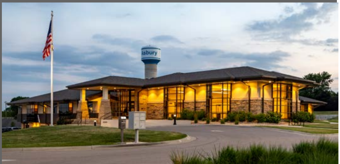
In 2016, the City of Asbury won the award for their community services center.

If your city completed a remarkable project in the 2022 calendar year, then apply for the All-Star Community Award. The winning cities will be announced this summer and recognized at the League's Annual Conference & Exhibit in Cedar Rapids in September. Submit your application by April 3 at www.iowaleague.org/awards/all-star-community-awards/ .