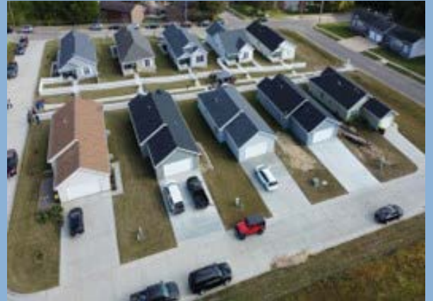
The Maquoketa Pocket Neighborhood was funded, in part, with EIRHC Housing Trust Fund dollars.

The Eastern Iowa Regional Housing Corporation Housing Trust Fund Program which serves Cedar, Clinton, Delaware, Dubuque (excluding the city of Dubuque), and Jackson Counties, was awarded $498,359. The grant funds will be used for down payment assistance, owner occupied rehabilitation, rental-rehab/new development and lead reduction.