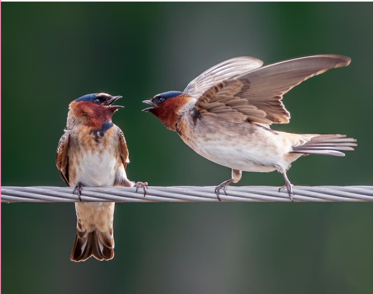
Photo Credit: Sharon Scarff, 1st Place Iowa Wildlife & 1st Place Best of Show

15th Annual Keep Iowa Beautiful Photography Contest Submission