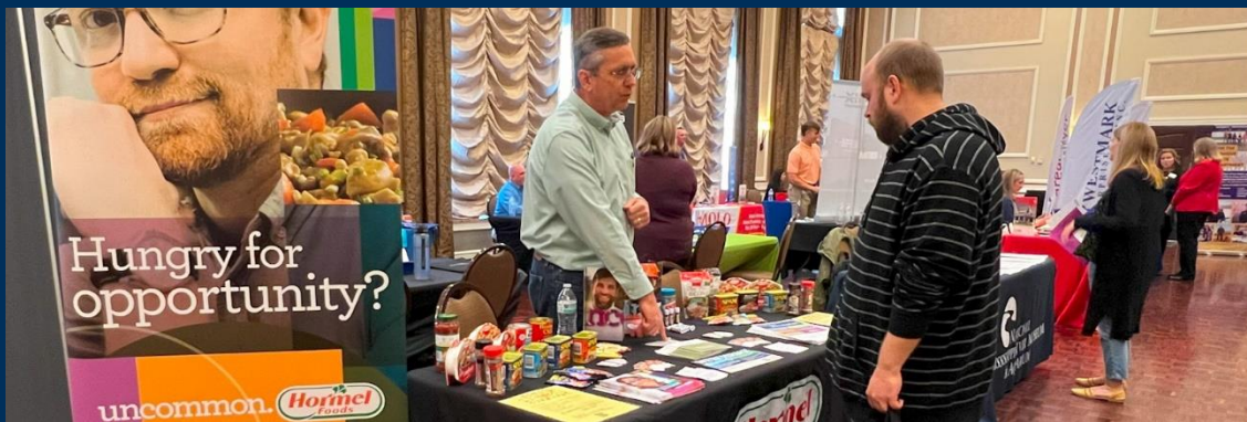
Representative of Progressive Processing/Hormel Foods connect with job seeker at our October 11, 2023 AccessDubuqueJobs.com Fall Career Fair at the Hotel Julien in downtown Dubuque.