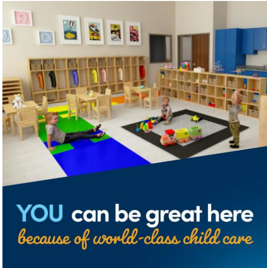
Rendering of classroom at the new Dubuque Y Early Learning Center at the Bright Minds Learning Campus.