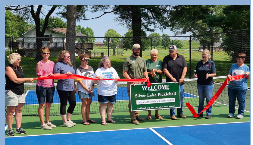
Delhi Hometown Pride committee and stakeholders

The idea came about during a KIB HP meeting in early 2023 on the heels of a community survey where pickleball was mentioned many times. The Hometown Pride program is a five-year commitment and provides a community coach to work with volunteers to help realize projects and events. From that point on, the committee tenaciously pursued the project through fundraising and grants, securing private donations totaling $10,563, scoring a Rural Enrichment grant of $20,000 and a donation from a local pickleball enthusiast in the same amount in 2023. The McElroy Trust came in at $7,500 and the Foundation for the Future of Delaware County granted $1,250. When nearly all the money was raised, the group worked together to obtain project quotes and schedule the work.