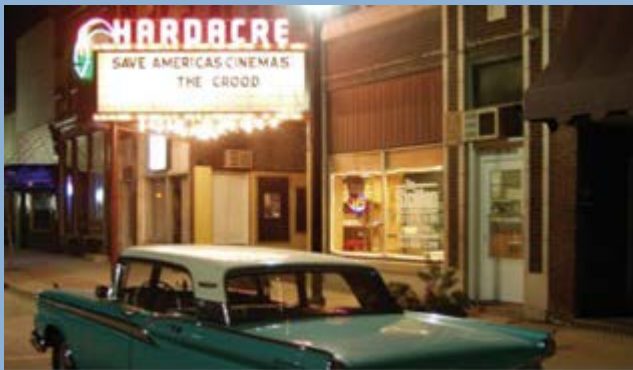
Hardacre Theater Marquee back in the day

The balance of the Great Places grant, $270,850, requires a 1:2 match ($1 match for every $2 raised), therefore, the Hardacre board will need to raise an additional $541,700 to access all of the Cultural Affairs grant funds. The entirety of this funding will be used for theater renovations and improvements. Grant funding was a cooperative effort of the local Hardacre organization, Cedar County Economic Development Corp. (CCEDCO), the Cedar County board of supervisors, and the City of Tipton. If all funds for HRDP and Great Places are secured, that will amount to $1,032,970 toward the renovation of this key Cedar County asset.