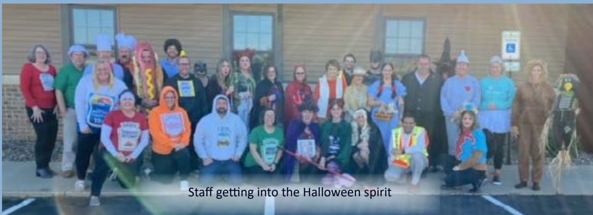
Staff getting into the Halloween spirit

ECIA will be honored with other winners at an awards dinner in April at the Diamond Jo.