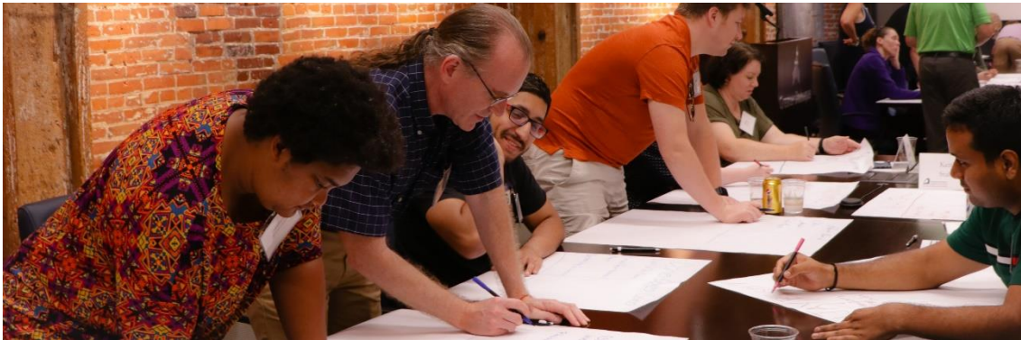
Participants in the 54th session of Distinctively Dubuque end their August 23 class with an interactive introduction activity that including drawing quick sketches of 3 interests or hobbies they wanted classmates to know about them.