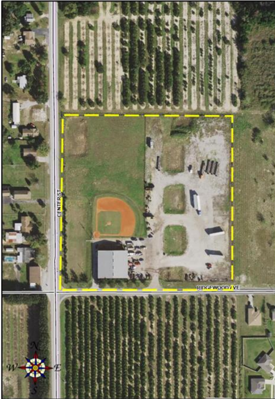
AERIAL MAP CLOSE UP