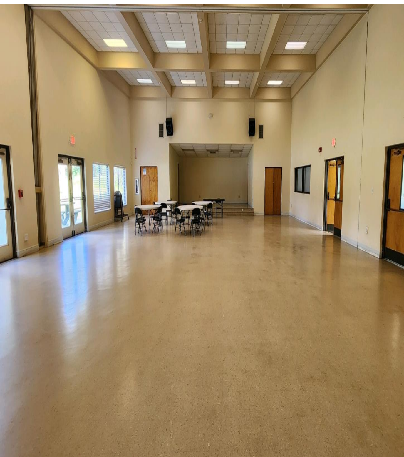
EXHIBIT – C