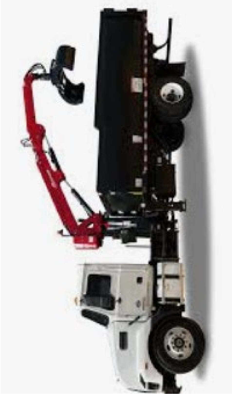
EXHIBIT A IFB 24-11