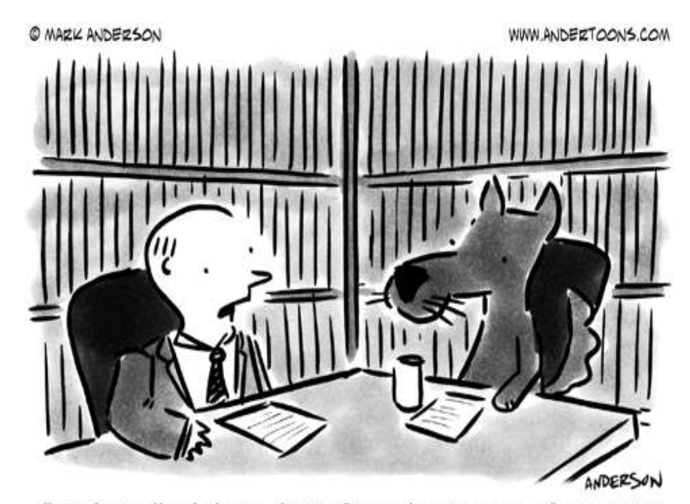
"We've talked them down from destruction of property to misdemeanor huffing and puffing."