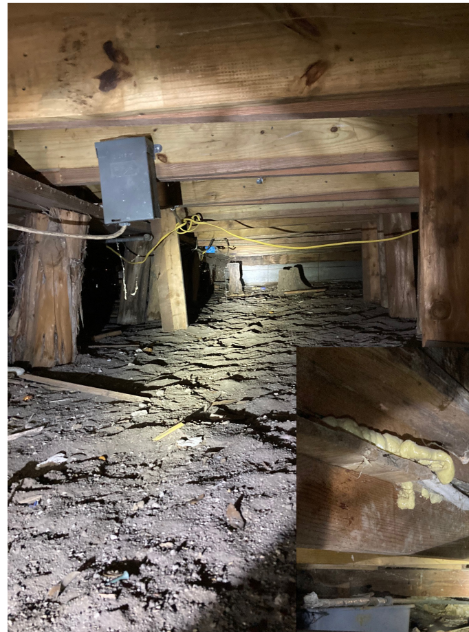
Severe damage to cedar piles - full replacement and leveling required