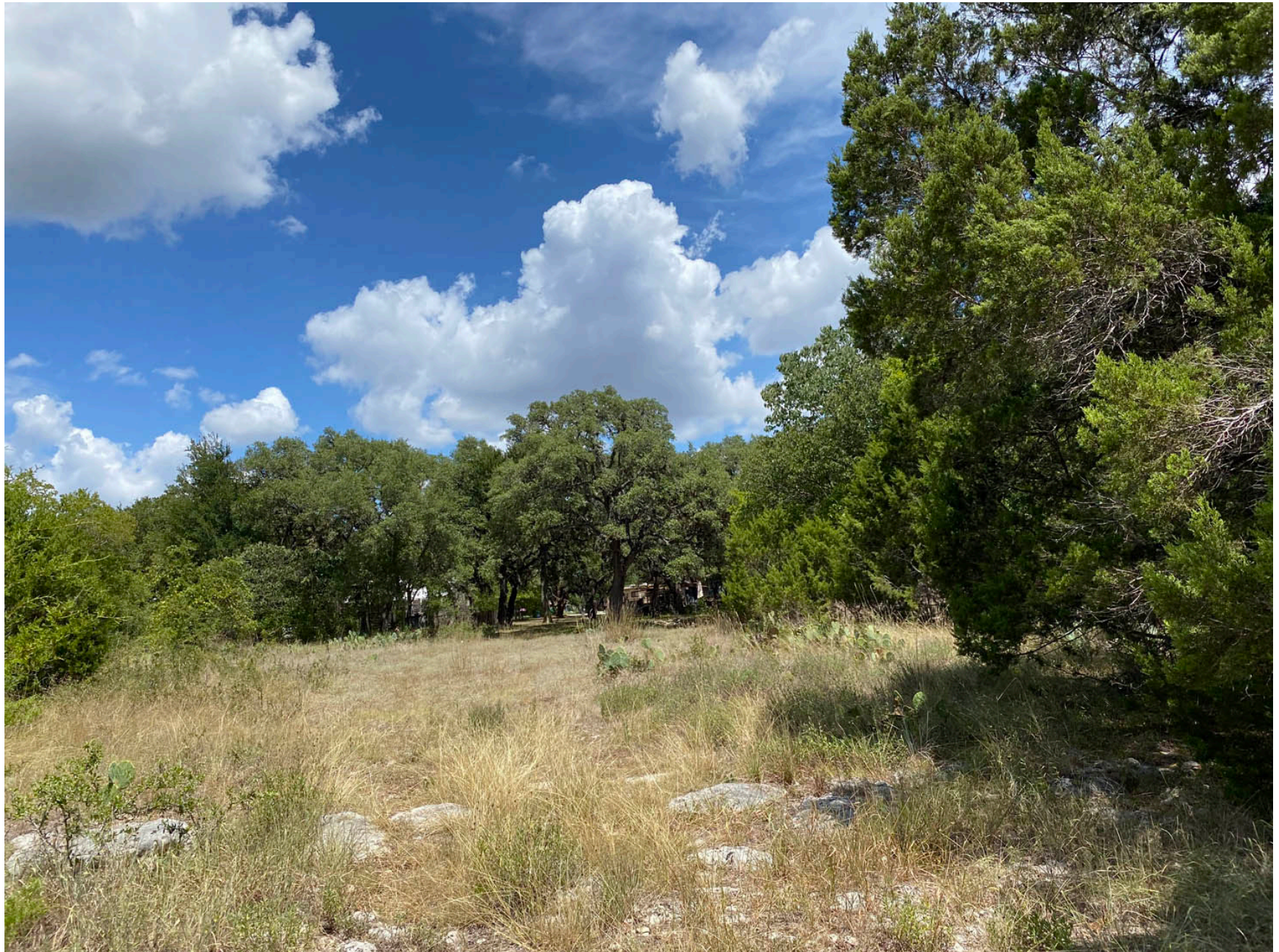
Mid-property grasslands and open space