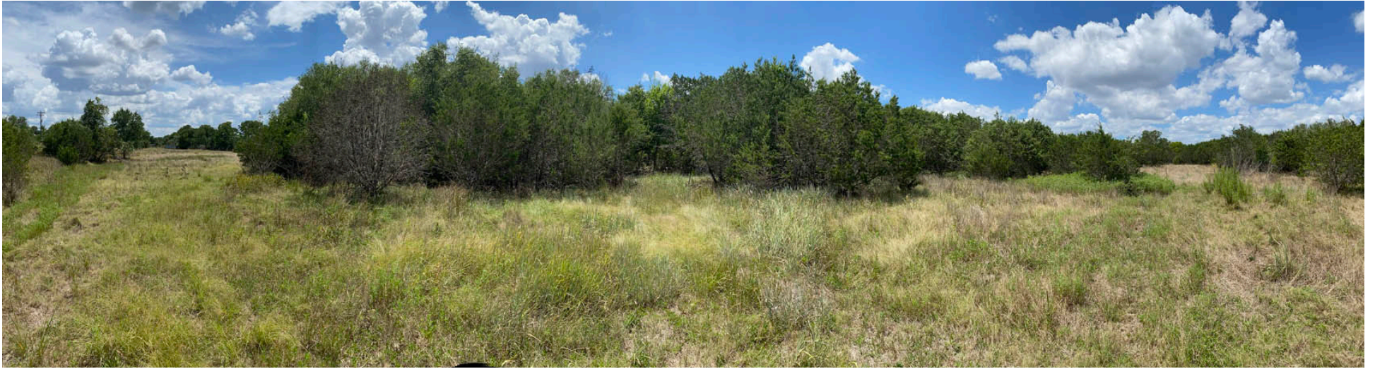
Lower Third - Preserve Draw