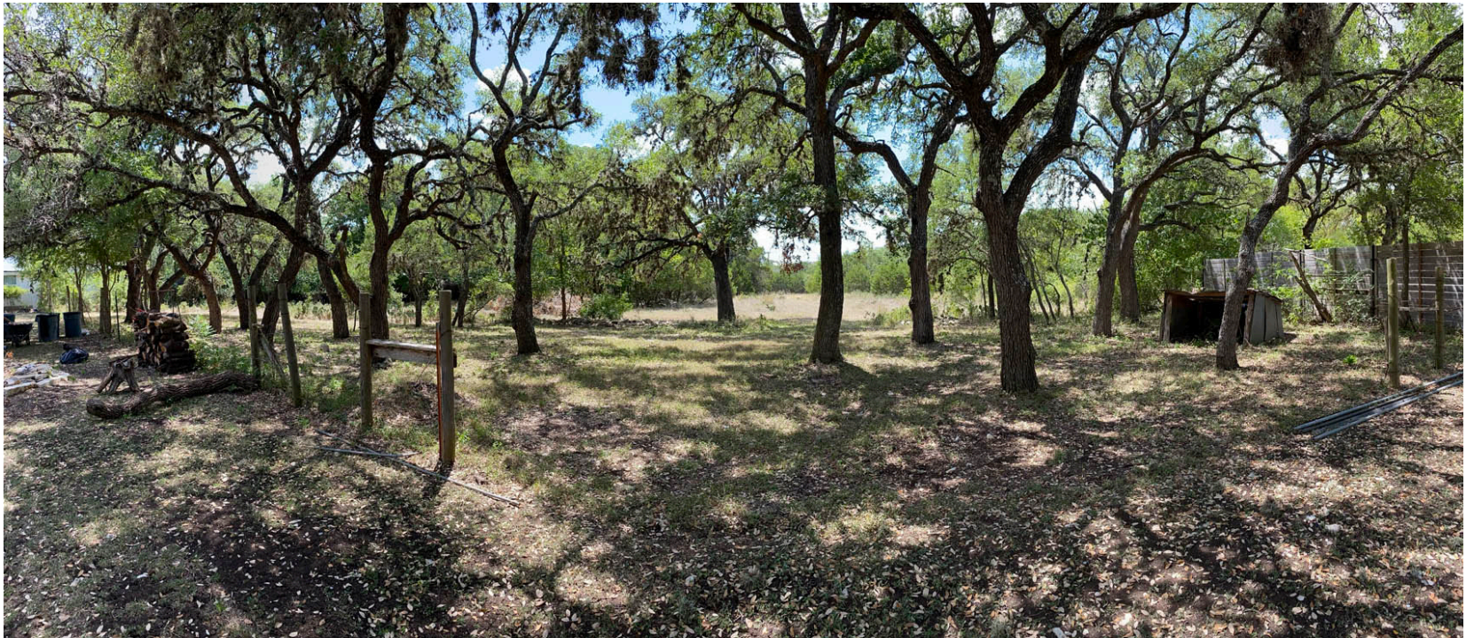
Original House - Tree Canopy