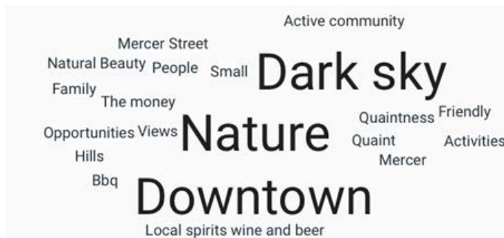
Figure 6. Community Engagement Word Cloud 2

While a full discussion of the community input process can be found in the appendices, it is important to note that the consensus reached by the community regarding their community values was significant in its consistency. Further, the community values were wholly articulated by the community (i.e the responses were not prompted in any way – the survey’s first two question were to describe what Dripping Springs meant to them in their own words and what their favorite feature was).