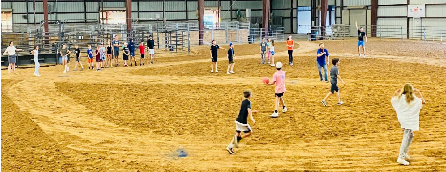
Kickball @ Tween Scene, Thursday Nights during summer 2021 – An instant hit!!!