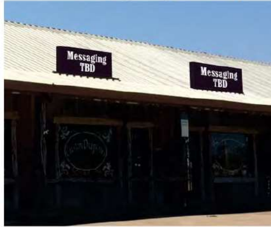
New Signage - Day