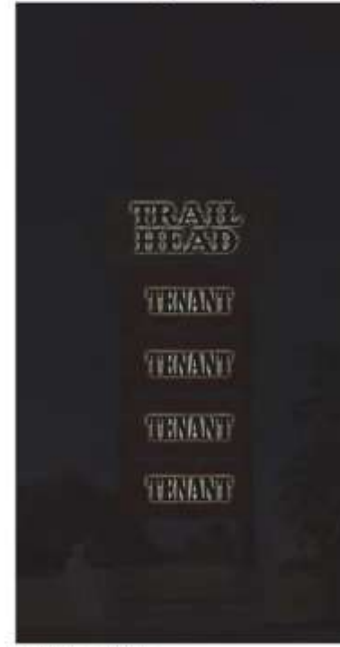
Proposed Sign Render Night View

Note: Masonry planter added at base of refaced pole sign; dark skies compliant lighting