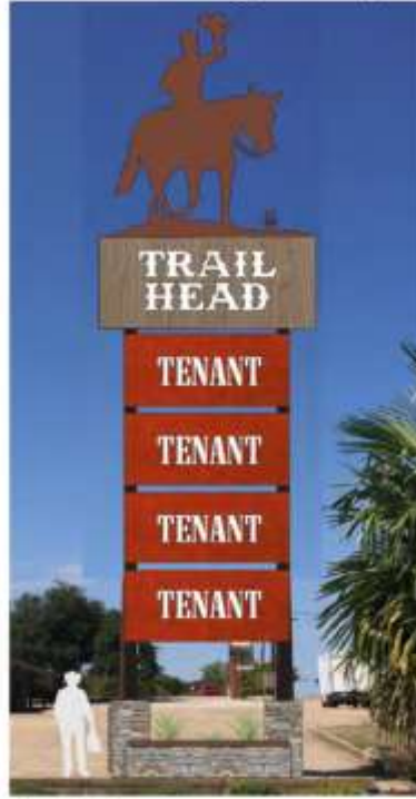
Proposed Sign Render