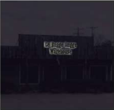
Proposed Sign Render Night View scale: NTS