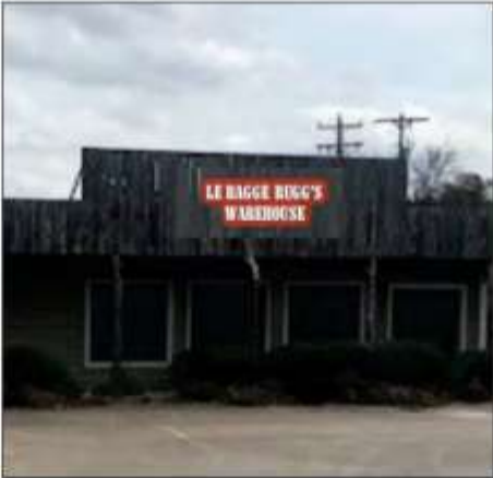
Proposed Sign Render scale: NTS