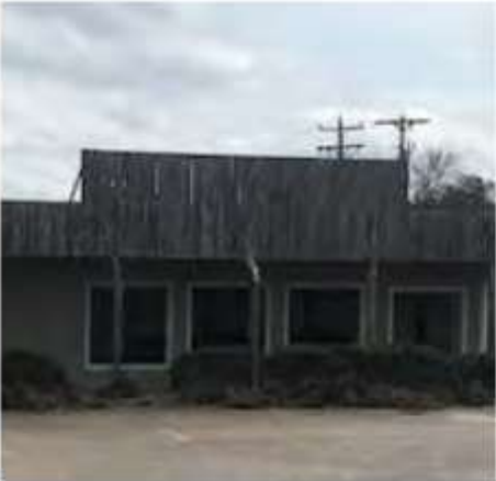
Current Sign scale: NTS