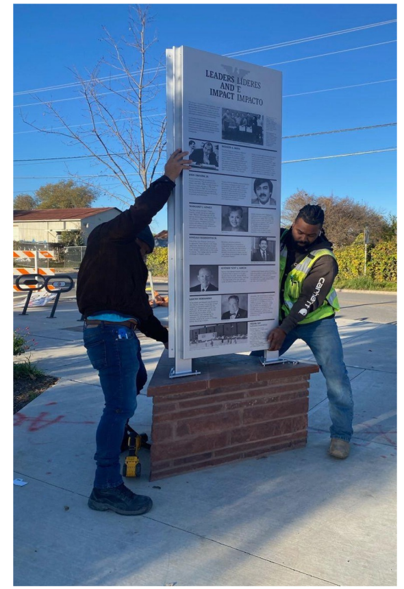
3-Sided Historical Interpretive Sign