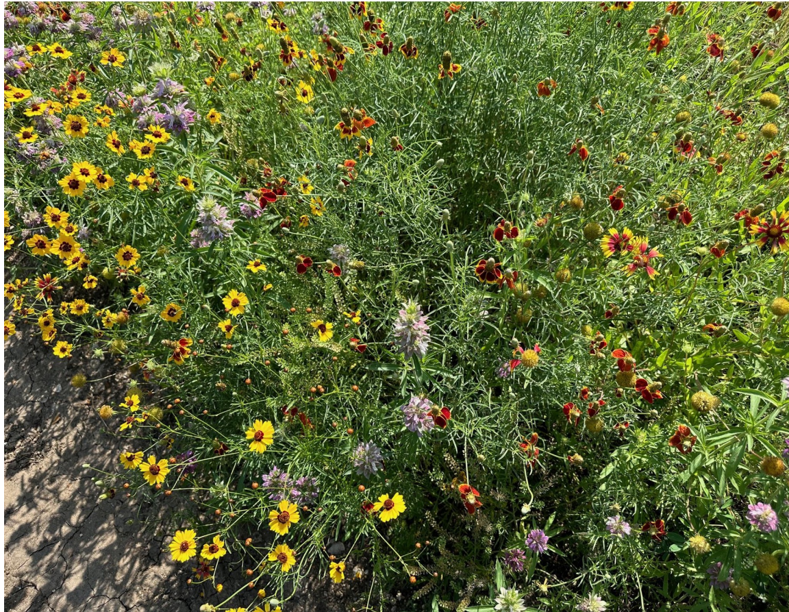
Native wildflower mix for the "Bowl"