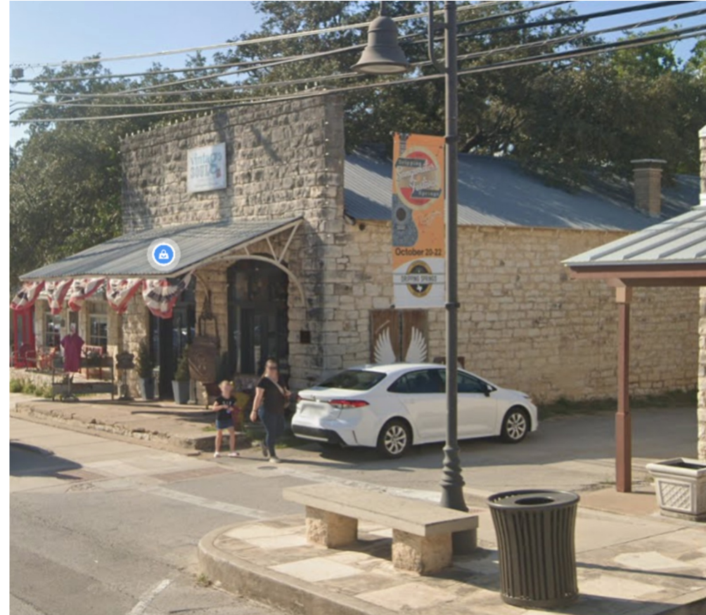
The Mercer Street Historic District uses limestone flagstone paving, limestone benches, specialty pedestrian street-lighting poles and litter bins to enhance the unique identity of this main street.

This is a unique opportunity to create an enhanced, inviting place that helps tell the story of Dripping Springs' history, landscapes and preservation by re-imagining this highly-visible entry to the Old Fitzhugh Road historic district.