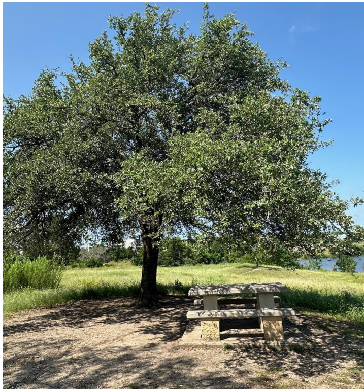
Limestone picnic table under Hill Country native, the Live Oak