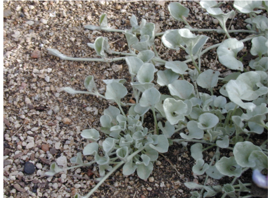
Silver Ponyfoot for Curbside Planting Zones