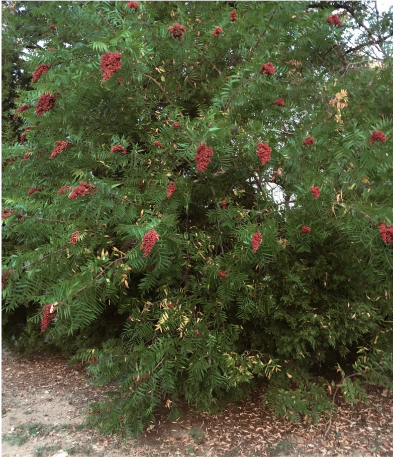
Evergreen and Flameleaf Sumac will shape and buffer the Gateway Garden from the RM 12 traffic.