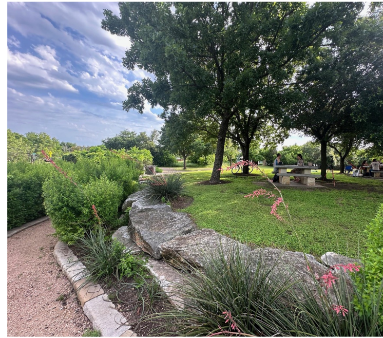
Limestone ledgerrock along flagstone and gravel and pathways