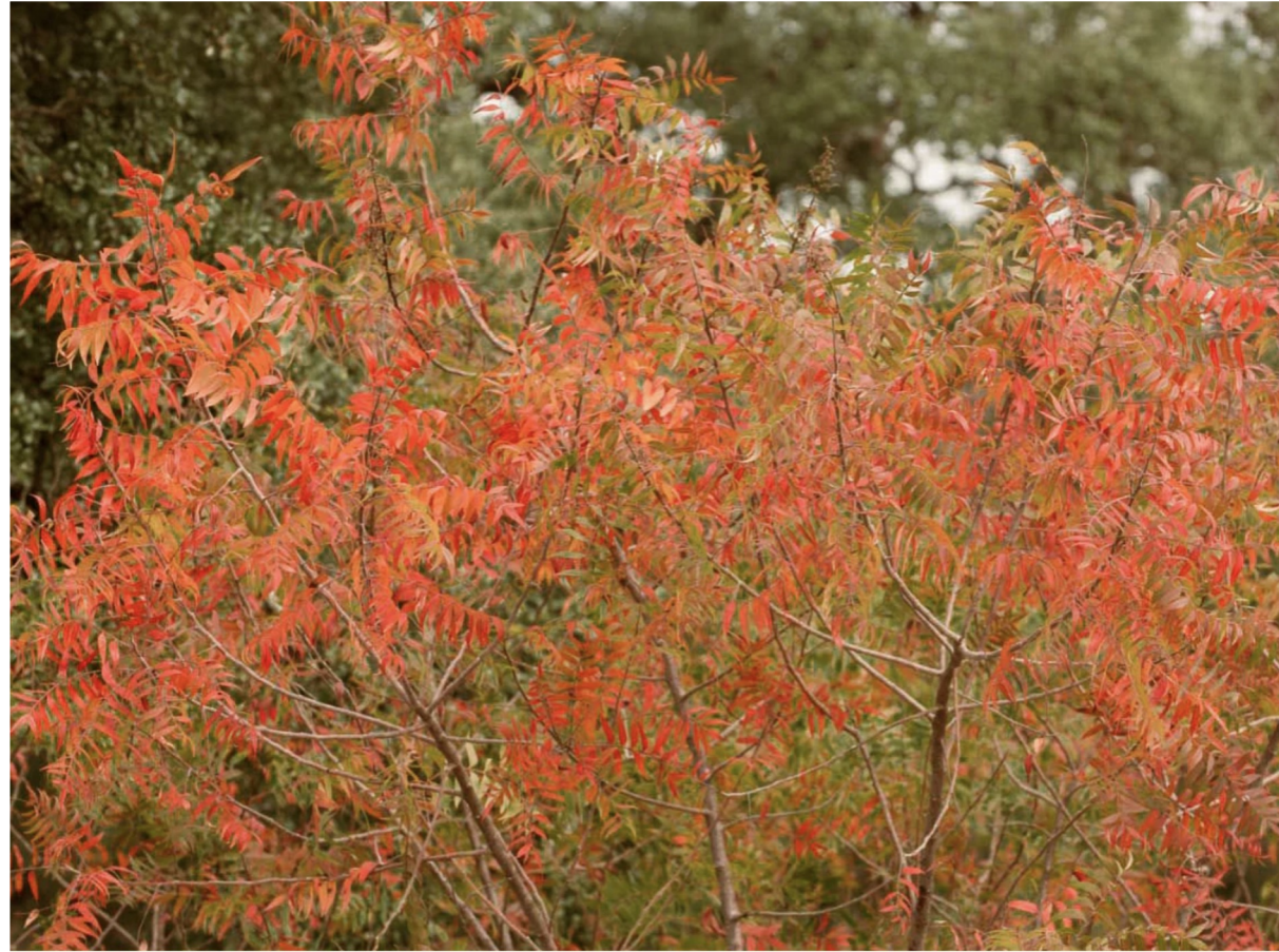
Autumn color of Flameleaf Sumac