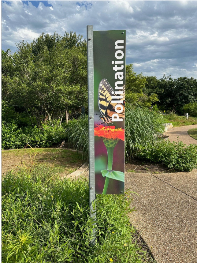
2-Sided Interpretive Sign Identifying Plant Types, Located along Greenway Trail